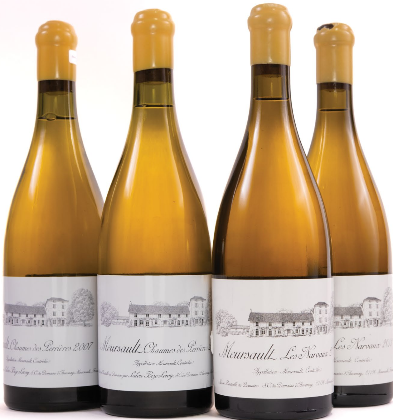
Lots 203 & 209

One will notice that many perfectly stored bottles from Domaine d'Auvenay will have assessment notes of signs of seepage. This is due to the fact they are overfilled at the domaine and are not an indication of poor storage conditions.